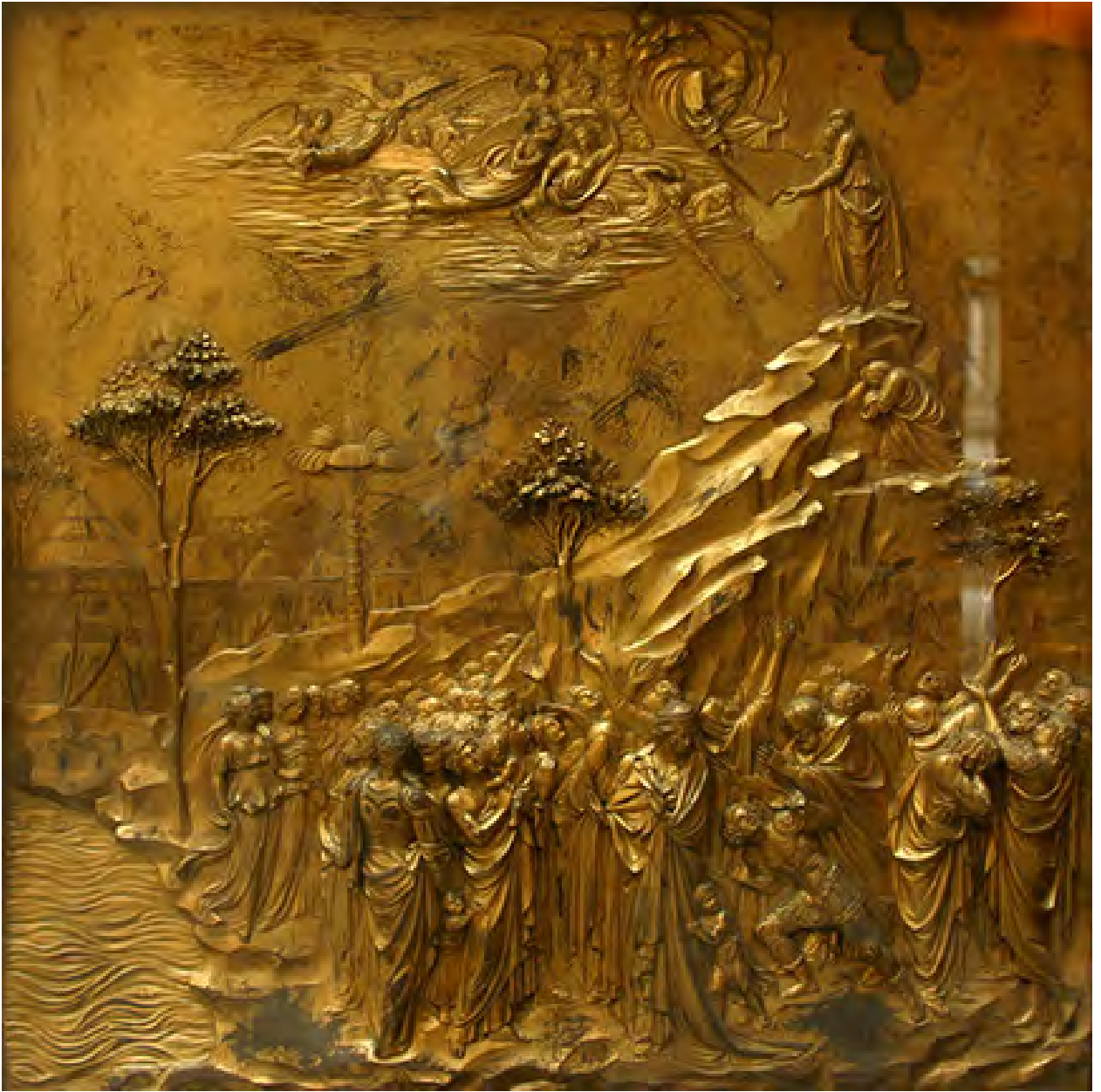
Moses Receiving the Law from God