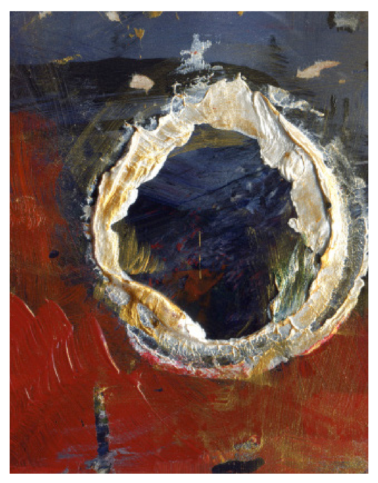
EIGHTEENTH SUNDAY AFTER PENTECOST September 22, 2024 8:30, 9:30 & 11:30 am Worship