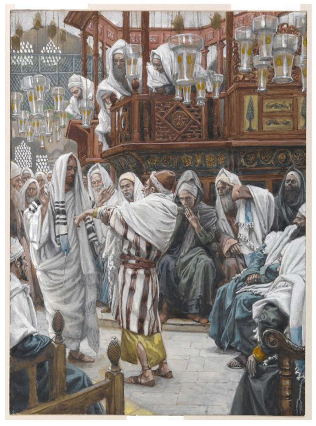
"Man with the Withered Hand" by James Tissot