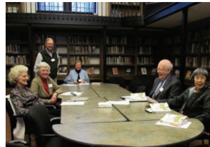
Adult education and discussion at Wednesday 2:42.