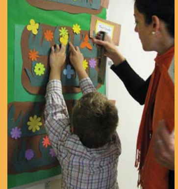
First Pres kids plant flowers for the 2012 Stewardship Campaign!