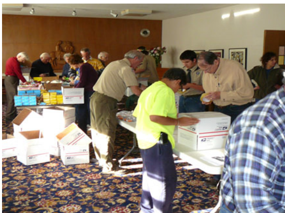
Boxes being prepared for mailing.